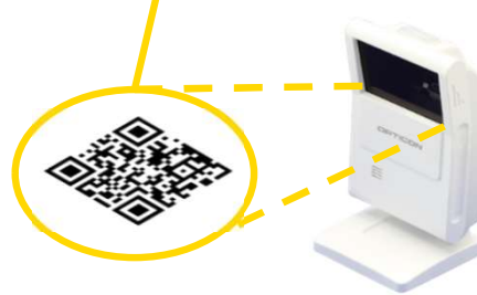
Processing program identification by QR code